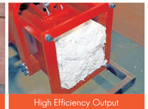
High Efficiency Output