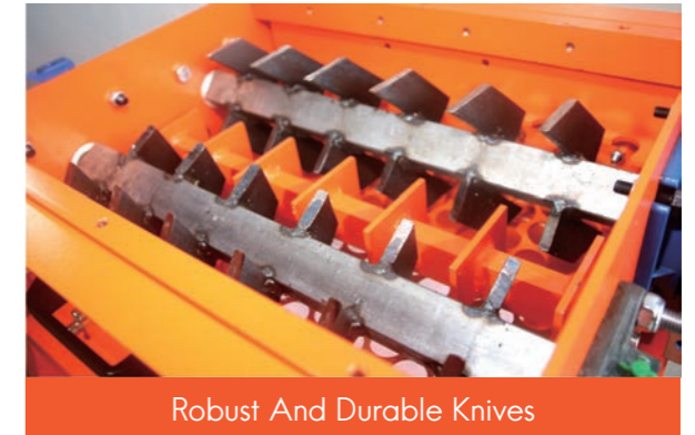
Robust And Durable Knives